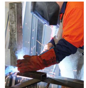
Procurement, Project Management, Manufacture, Service and Maintenance