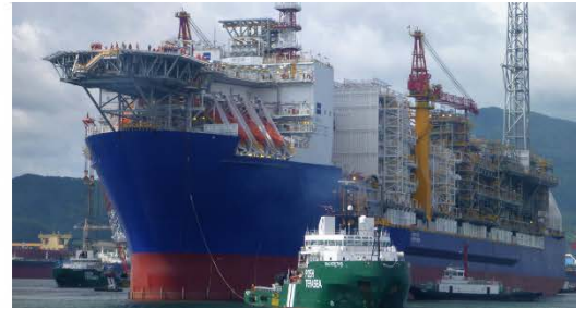
Air Conditioning, Refrigeration, Electrical, Systems Integration