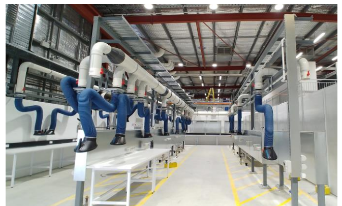
Commercial & Industrial Sites