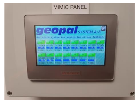
Field Instrument installation & Controls